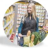
Article price list