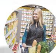
Article price list